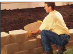
3. Install Additional Courses

Backfill first course units with clean granular fill material (i.e. crushed stone/gravel). DO NOT USE PEA GRAVEL! Compact with hand tamper or appropriate mechanical compactor. Backfill and compact behind each course before installing additional courses.