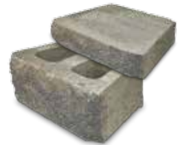
JAWS Technology® face option available in certain markets.