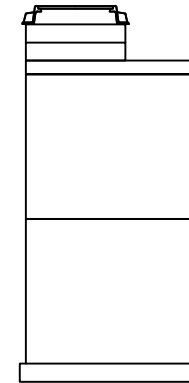
MH W/ FLAT LID